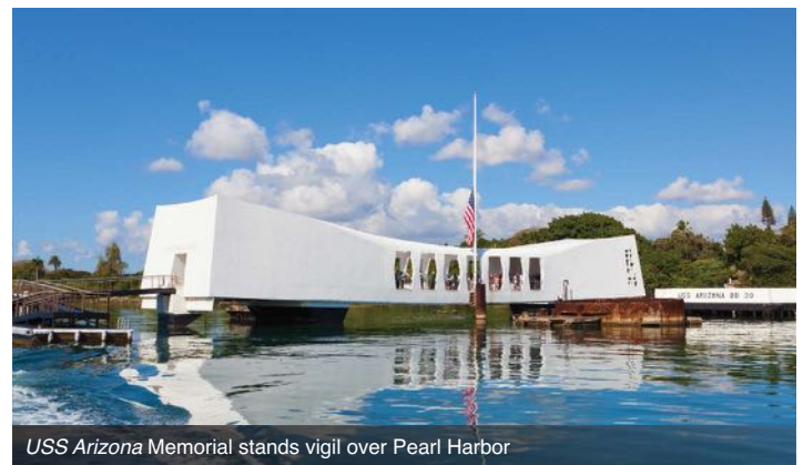
USS Arizona Memorial stands vigil over Pearl Harbor

Today is yours to explore Honolulu at your leisure. Visit more historic sites or find a cozy spot to relax on Waikiki Beach.