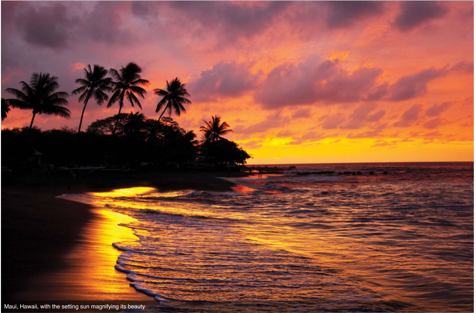
Maui, Hawaii, with the setting sun magnifying its beauty