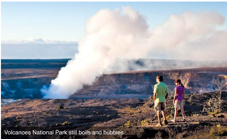
Volcanoes National Park still boils and bubbles