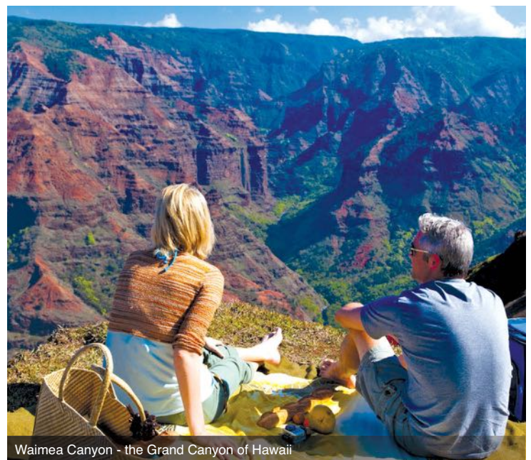
Waimea Canyon - the Grand Canyon of Hawaii

After a morning free, your Tour Manager will arrange a transfer to the airport. Fly through the night and return home early in the morning with memories of Hawaii’s superb culture and beauty. (Breakfast))