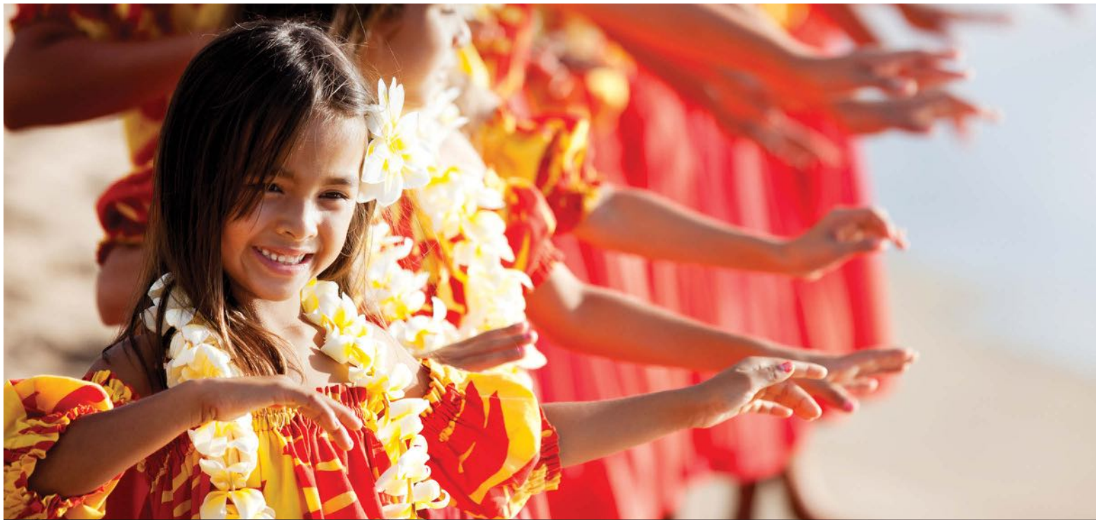
The beautiful children of Hawaii dancing the Hula