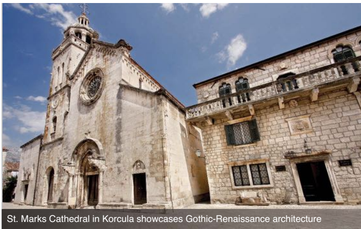
St. Marks Cathedral in Korcula showcases Gothic-Renaissance architecture