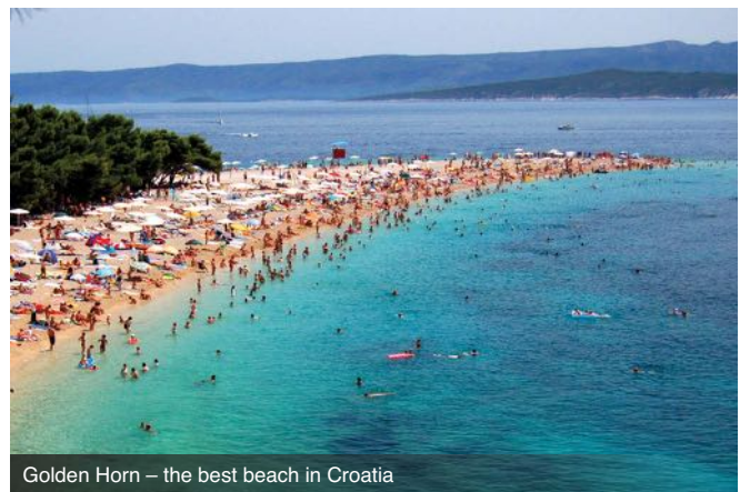
Golden Horn – the best beach in Croatia

Itinerary is subject to change based on operating conditions.