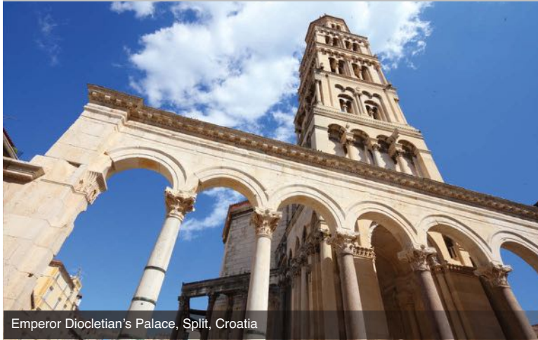
Emperor Diocletian's Palace, Split, Croatia