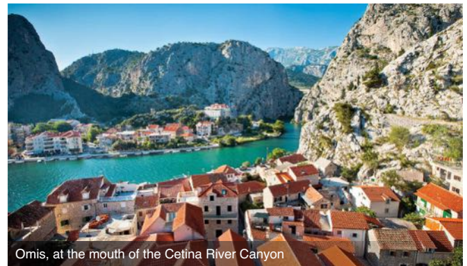
Omisi, at the mouth of the Cetina River Canyon